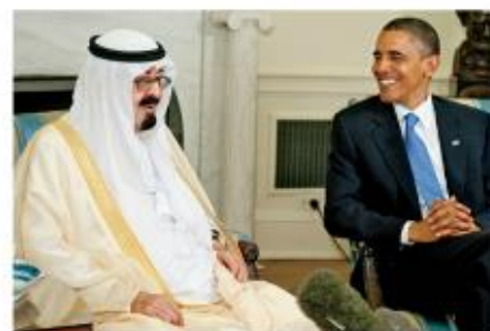
President Obama with Saudi King Abdullah at the White House in 2010

allies to behave in a manner more in line with American values.