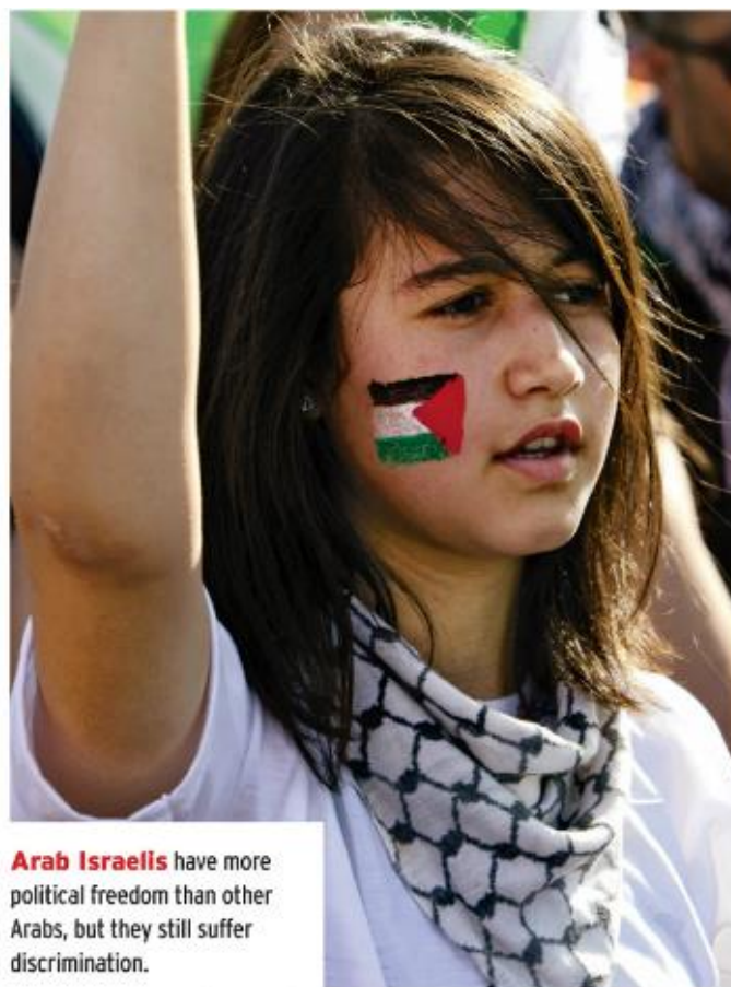
Arab Israelis have more political freedom than other Arabs, but they still suffer discrimination.

Inside Israel, there are 1.6 million Arabs who are Israeli citizens.