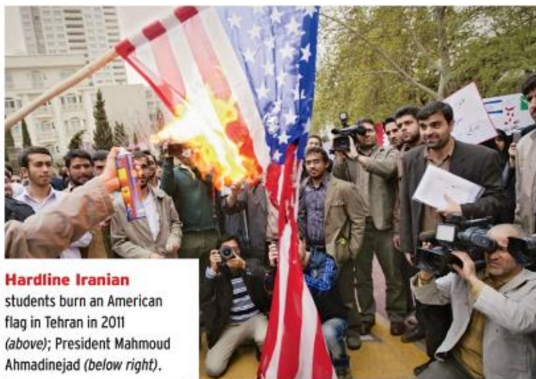
Hardline Iranian students burn an American flag in Tehran in 2011 (above); President Mahmoud Ahmadinejad (below right).

New York Times columnist Nicholas Kristof says that injustice against women is the central moral challenge of the 21st century. Fighting against gender inequity is also practical, he says, because it has positive effects on many other social and economic problems.