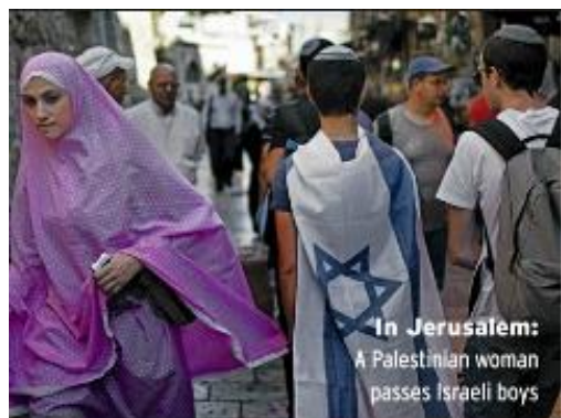
In Jerusalem: A Palestinian woman passes Israeli boys