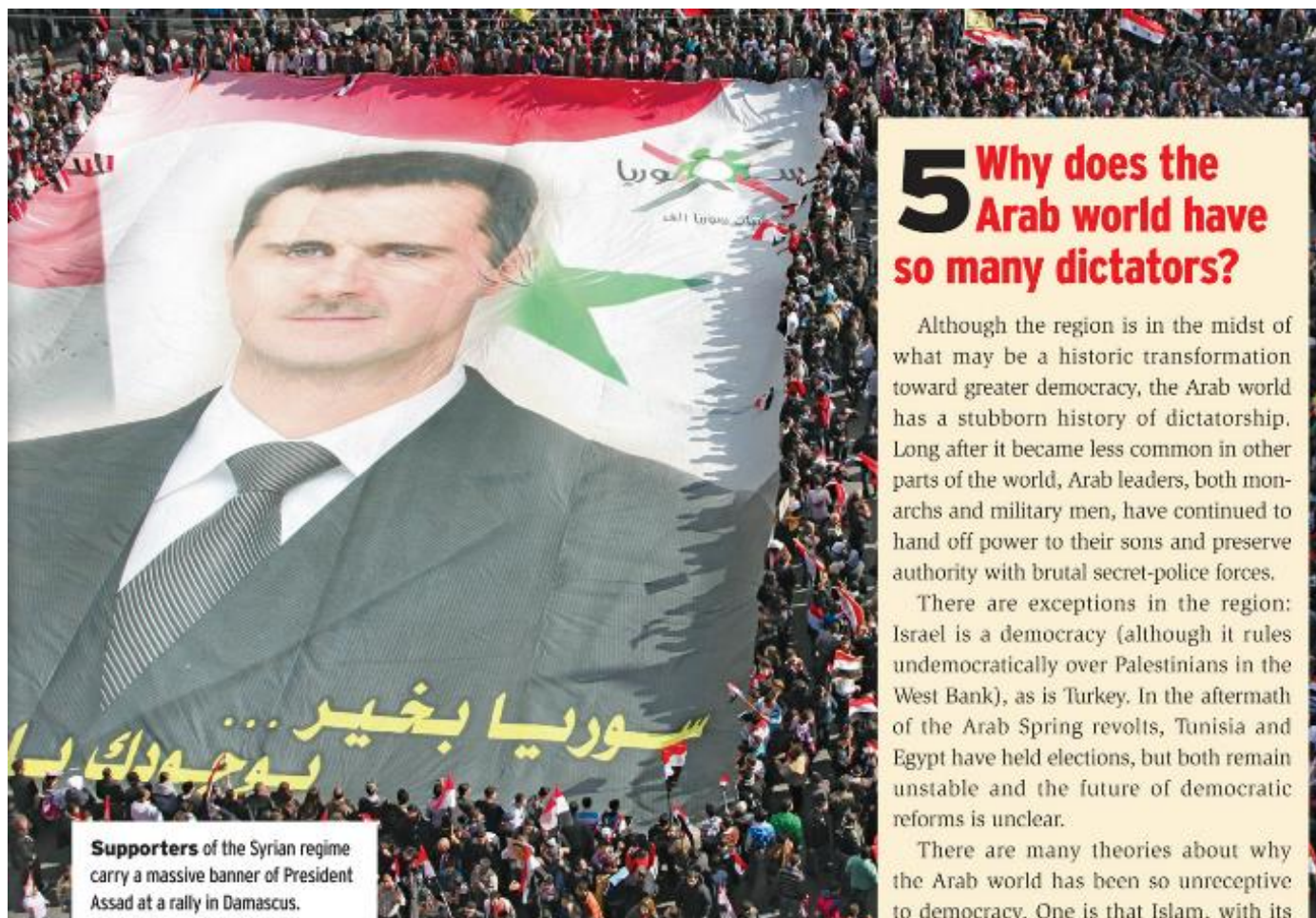
Supporters of the Syrian regime carry a massive banner of President Assad at a rally in Damascus.